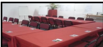
Our Conference facility hosts 30 people in comfort