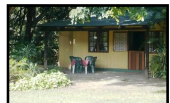
One of our historical wood and iron self catering units