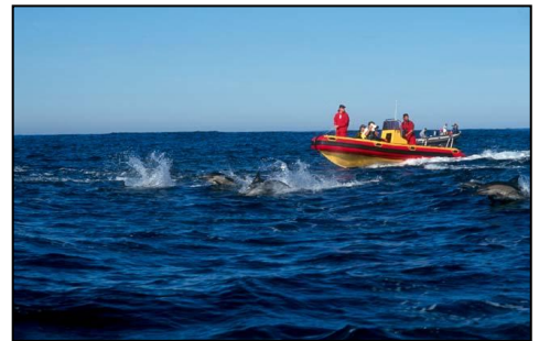
Common Dolphin thrilling sightseers.

www.bluespheremedia.com/southafrica-sardinerun-video.html